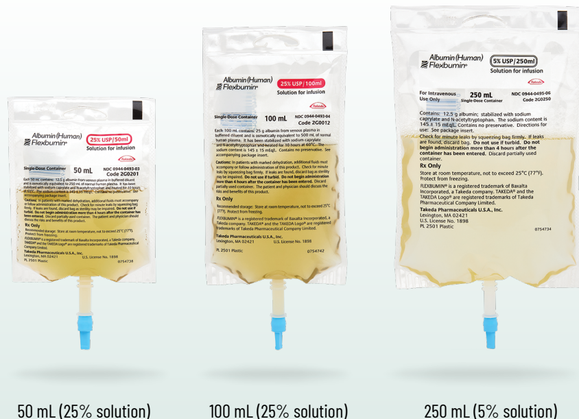
50 mL (25% solution)